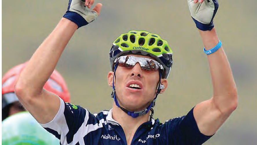
Portugal's Rui Costa wins stage 8 of the 2011 Tour de France