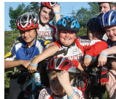
Young cyclists in Ireland show their support for Bike Pure.

Bike Pure also enjoy close ties with many national anti-doping agencies including the World Anti-Doping Agency (WADA) and USADA (United States Anti Doping Agency).